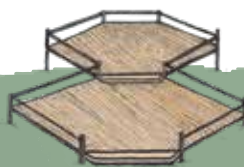
DECK 1 R1,200 (max 35 people)